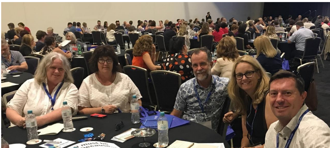
2018 QTU Union Reps Conference: some of the local reps